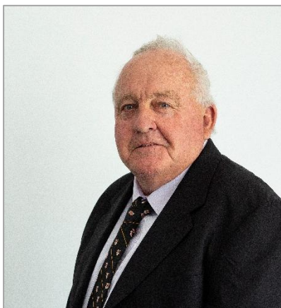
Councillor Greg Whiteley Mayor

Warren Shire Council embraces the inclusion of people with disabilities in all aspects of community life. We are committed to creating a more inclusive and welcoming community for people with disabilities and it is with pleasure that I present the Disability Inclusion Action Plan. The Plan aims to improve conditions for people with a disability who live, work and visit our Shire outlining our commitment to improve the quality of our services, facilities, systems and programs over a 5-year period. The Plan was developed through consultation with the community and outlines the actions we will take to provide more accessible and inclusive services.